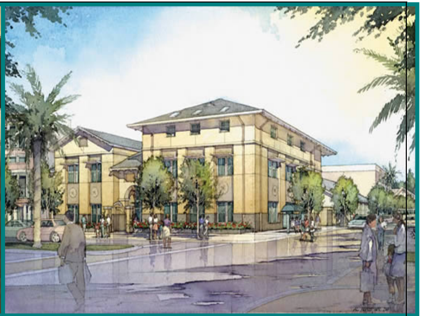
2007 Day Home