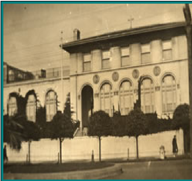
1911 Day Home