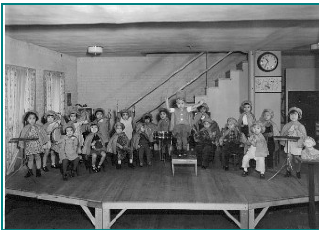
The Kinder-band rings in the New Year in style at the store-front center