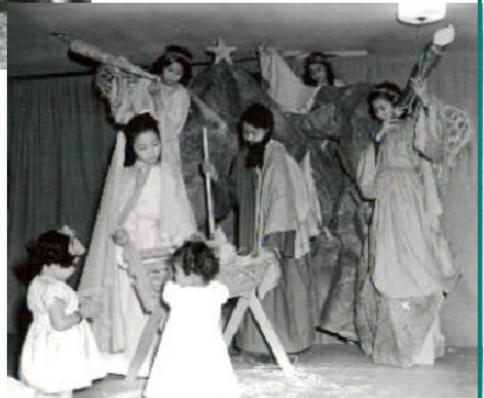
and Christmas tableau