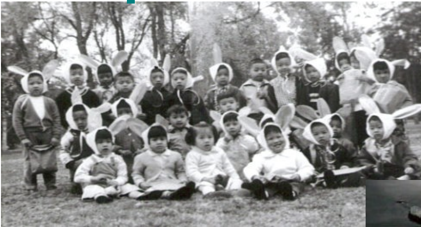
The Easter Parade