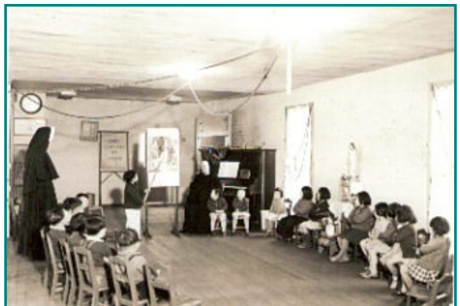
The Sisters conducting singing during religion class.