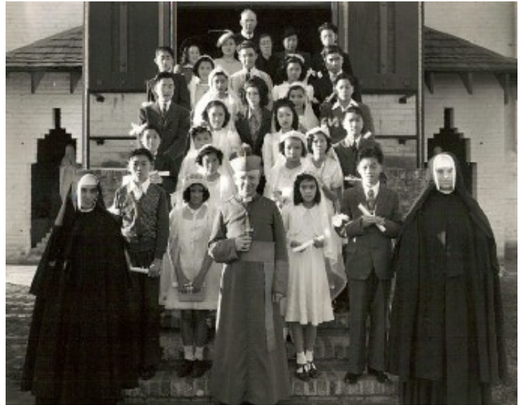
First Communion and Confirmation